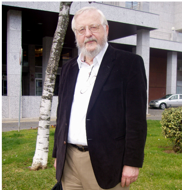
F. William Lawvere, Braga, March 2007