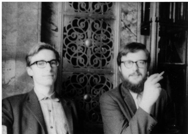
F. W. Lawvere with the author at Cafe Odeon, Zürich, Fall of 1966

The basis for this axiomatic science of cohesion is a string of four functors