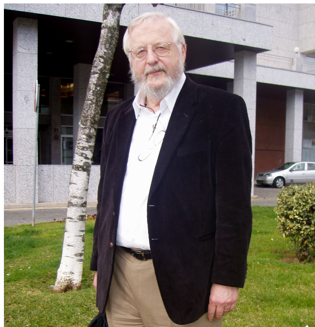
F. William Lawvere (Braga, March 2007)

Francis William Lawvere was one of the most influential figures in the late 20th Century and up till now, because of his drive to unify and simplify mathematics, by sharpening the tools of category theory. The following is an attempt of describing some of the milestones and visions in this process.